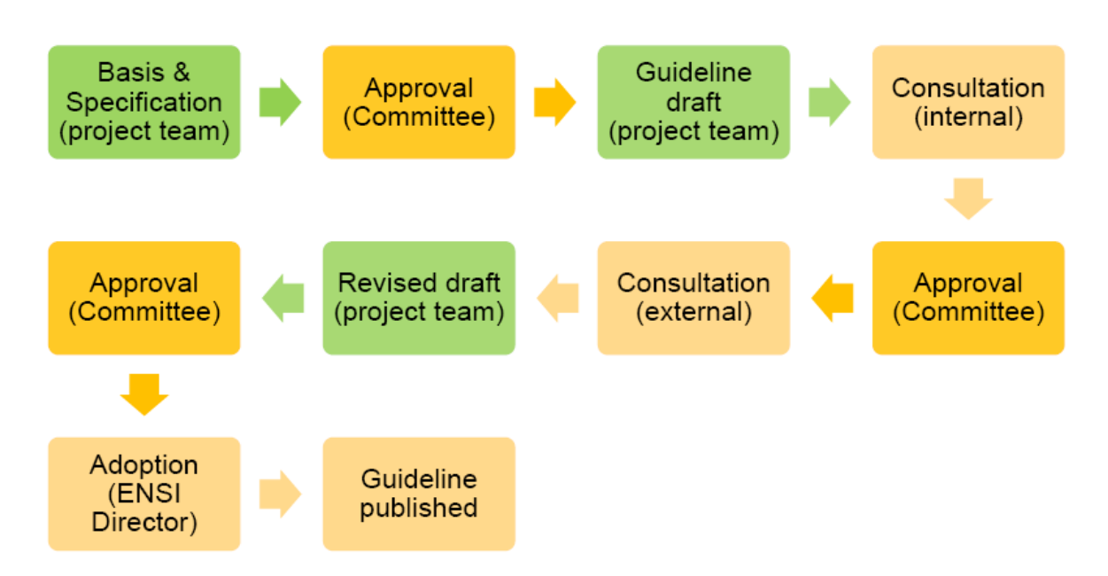
Figure 2: Process of Issuance Guidelines

ENSI itself develops Guidelines through a process known as "Regulatory Basis Process." The process contains several steps. An overview is shown in Figure 2 .